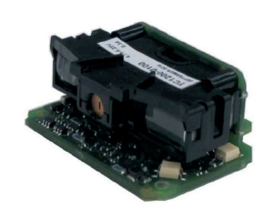
TC1200 SCAN ENGINE MODEL